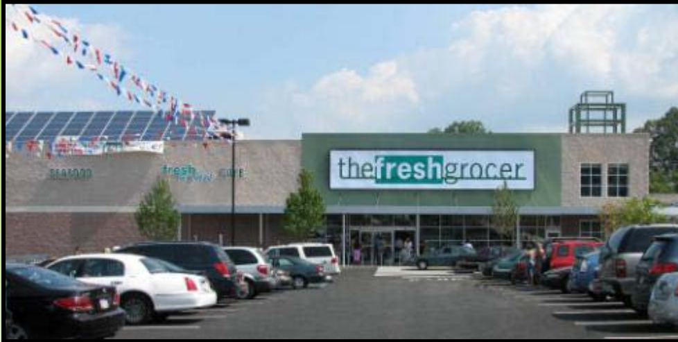
The Fresh Grocer at The Shoppes at La Salle Grand Opening August 21, 2009