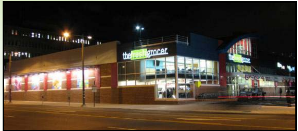
The Fresh Grocer at Sullivan Progress Plaza Grand Opening December 11, 2009